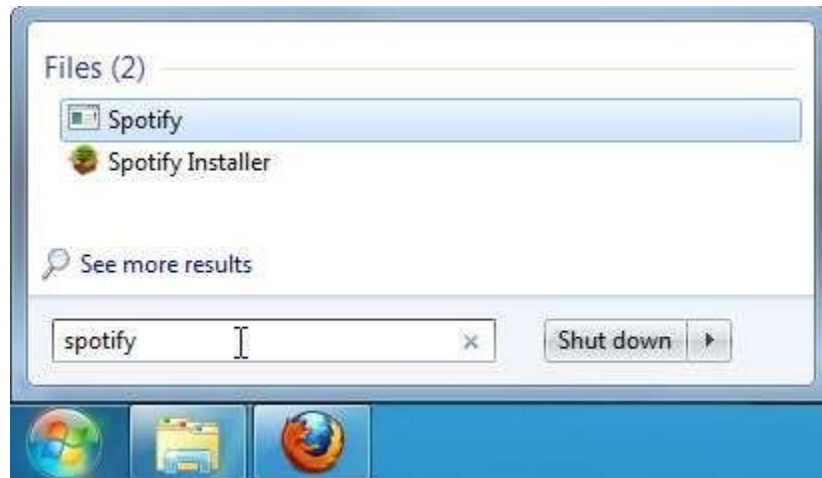
Figure 3: Search with windows 7