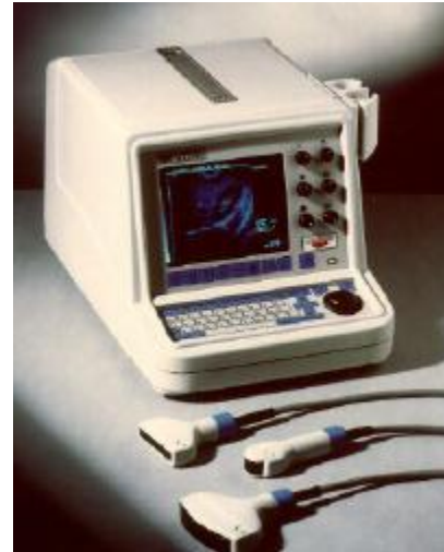
Ultrasound machine with various transducer probes