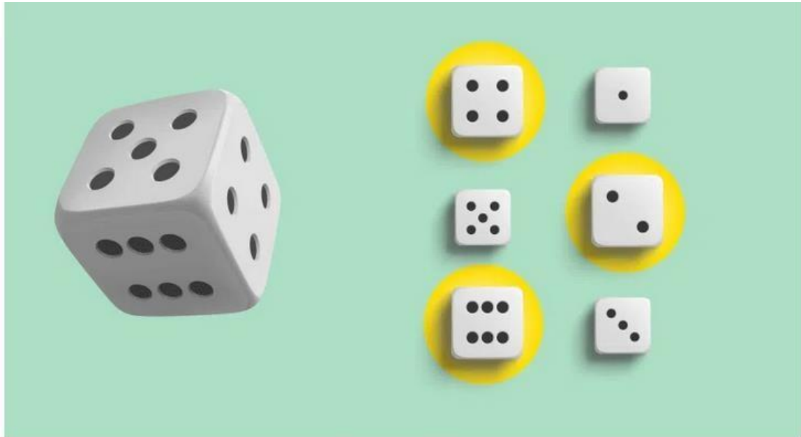
Probability of Rolling a Dice

Example : A dice is rolled. What is the probability that an even number has been obtained?