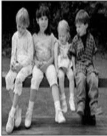
The human body