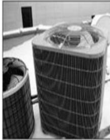
Air conditioning systems