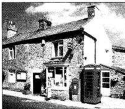
The post office in Preston