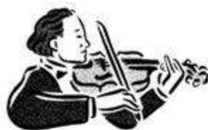
1 music musician