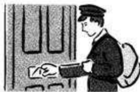
11 post _____