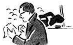
4 journal _____