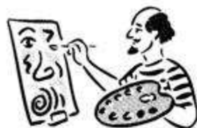
2 art _____