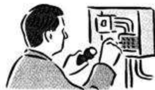
8 electric _____