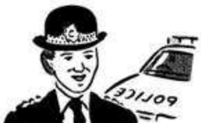
10 police _____