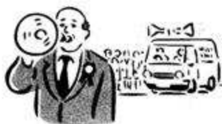
5 politics _____