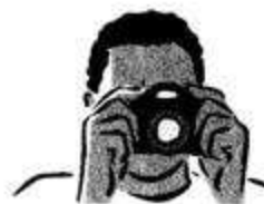
9 photograph _____