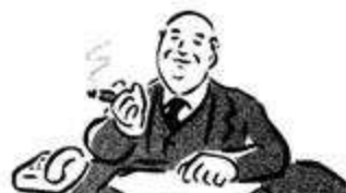
6 manage _____