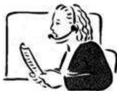
7 interpret _____