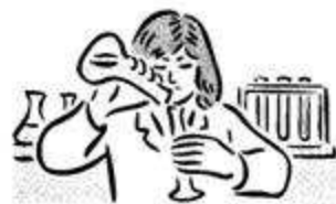
3 science _____