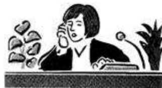
12 reception _____