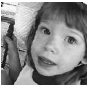
Original 8-bit image, 256 gray levels

Contouring appears in the image as false edges, or lines as a result of the gray_level quantization method.