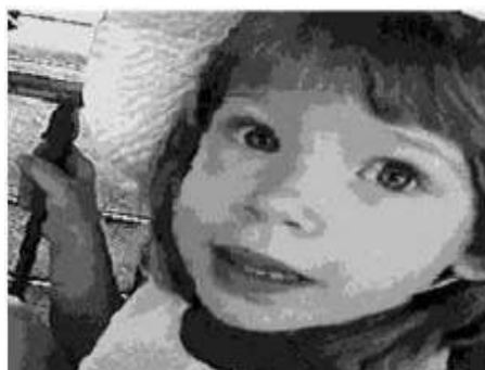
Quantized to 3 bits, 8 gray levels