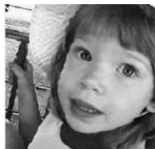
Quantized to 6 bits, 64 gray levels