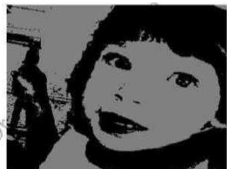
Quantized to 1 bits, 2 gray levels

This false contouring effect can be visually improved upon by using an IGS