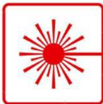
Laser radiation hazard