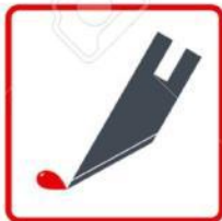
Sharp instrument hazard