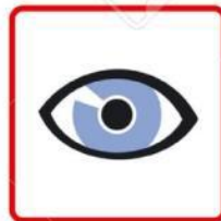
Eye & face hazard