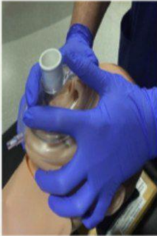
Two-handed C-E grip