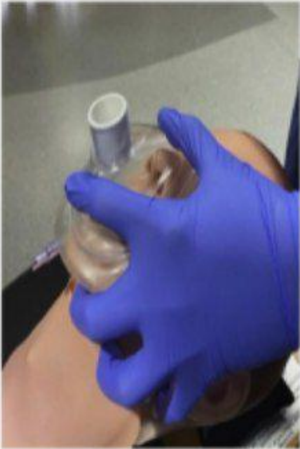
One-handed C-E grip