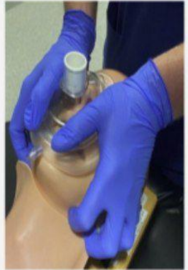
Two-handed vice grip