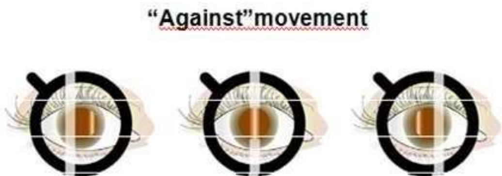
Figure (3): A red reflex showing "Against" movement.

When the red reflex moves in the opposite direction to the sweeping motion of the retinoscope streak, it is called "against" movement.