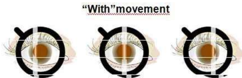
Figure 5: A red reflex showing "with" movement.

When the red reflex moves in the same direction as the sweeping motion of the retinoscope streak, it is called "with".