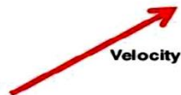
Figure 1 show the definition and examples of scalar and vector.

Vector quantities Displacement, Direction, Velocity, Acceleration, Momentum, Force, Electric field, Magnetic field