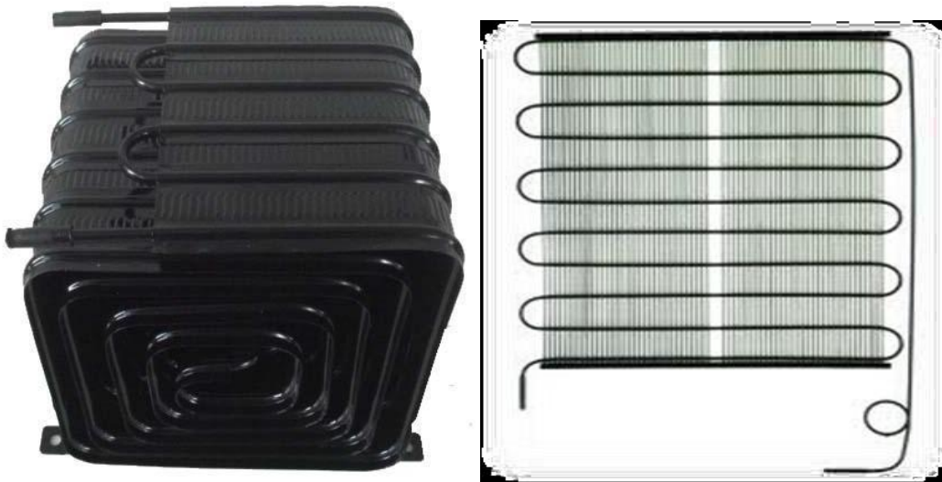
Figure (8-1:A,B): Natural convection.

natural convection type condensers are either plate surface type Fig(8-A) , finned tube type or wire and tube type. the common design is wire and tube type Fig(8-B), thin wires are welded to the serpentine tube coil. The wires act like fins for increased heat transfer area.