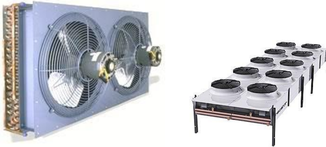
Figure(8-2): Forced convection heat exchanger.