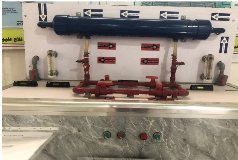
Figure(8-4): shell and tube heat exchanger.

These condensers are used in systems up to 50 TR capacity. The water flows through multiple coils, which may have fins to increase the heat transfer coefficient. The refrigerant flows through the shell Fig (8-4). In smaller capacity condensers, refrigerant flows through coils while water flows through the shell. When water flows through the coils, cleaning is done by circulating suitable chemicals through the coils.