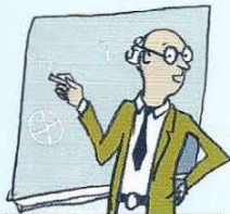
1 a teacher

a doctor a nurse a student a teacher a shop assistant a bus driver a businessman a police officer a builder