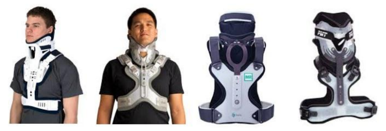
This orthosis consists of a sternal plate, shoulder pads, mandibular and occipital pads, and bars. This wearer maintains lumbar flexion.

plane via the mandibular and occipital pads. These collars have poor control of lateral flexion and axial rotation. Superior control of cervical segment motion is possible by attachment of metal posts to the hard collar, which is then attached to a pad that rests on the shoulders. Greater vertebral segment control can be provided by extending the orthosis to involve the thorax, thereby providing additional leverage to control cervical spine motion. This extension results in a cervical thoracic orthosis (CTO), the most commonly prescribed one being the SOMI (sternal occipital mandibular immobilizer) (Figure).