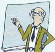
1 a teacher

a doctor a nurse a student a teacher a shop assistant a bus driver a businessman a police officer a builder