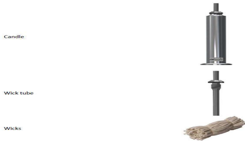
Figure1: Important tools

Smoke point apparatus, beaker, petroleum sample.