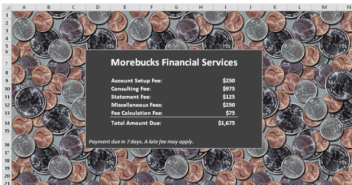
Figure (5): Adding any image file as a worksheet background image.

Keep in mind that using a background image will increase the size of your workbook because the image is stored in the workbook file.