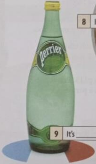
9 It's _____ water.

T 5.12 Listen and check. Practise the sentences.