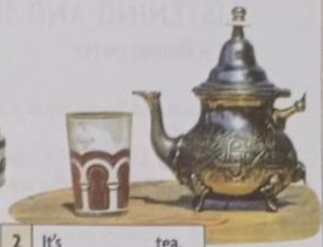
2 It's _____ tea.