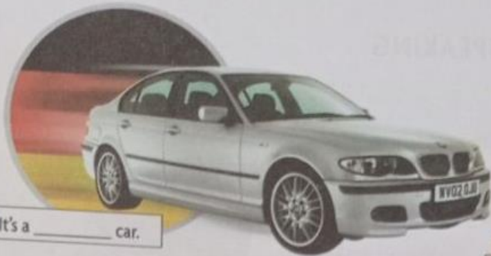
1 It's a _____ car.