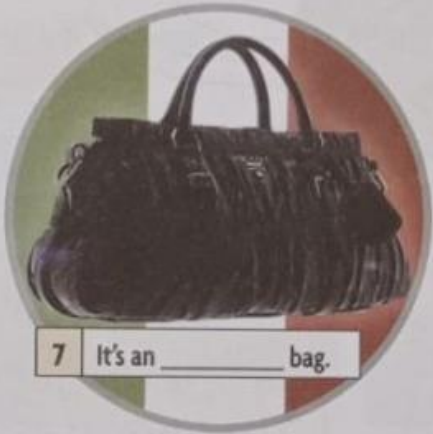
7 It's an _____ bag.