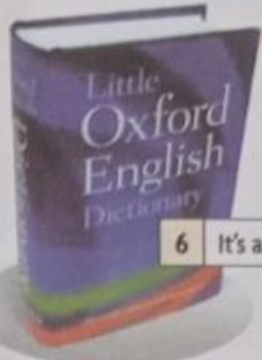
6 It's an _____ dictionary.