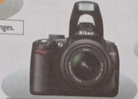
4 It's a _____ camera.