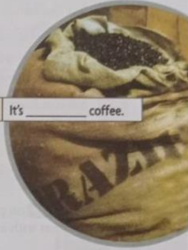
8 It's _____ coffee.