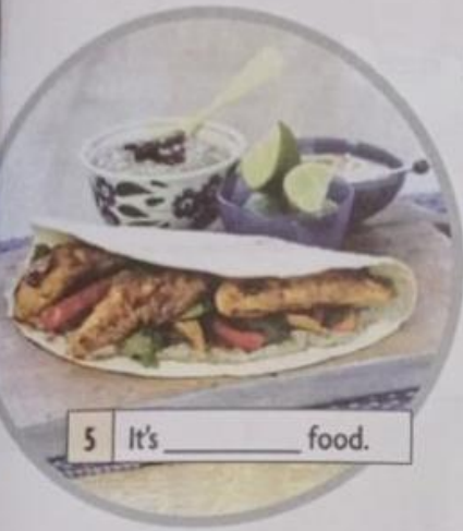
5 It's _____ food.