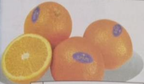
3 They're _____ oranges.