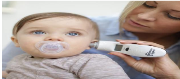
Figure 1-1 shows different types of thermometers(a- mercurial, b-electronic & c- tympanic)