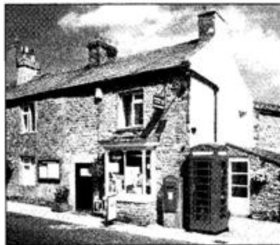
The post office in Preston