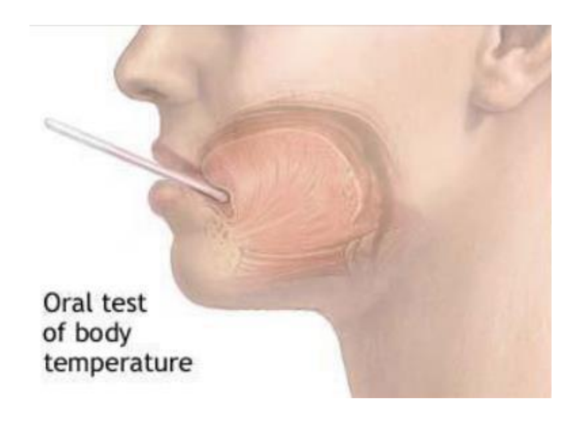
Figure 1-2: demonstrate oral temperature measurement