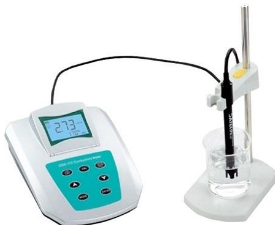
Fig. 1 Conductivity meter

Repeat the process using acetic acid with the same concentrations.