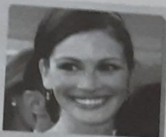
Julia Roberts • 1967–