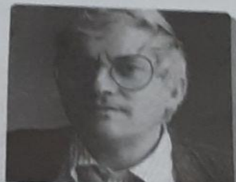
David Hockney • 1937–