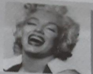
Marilyn Monroe • 1926–1962