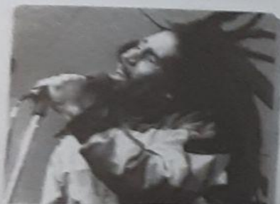
Bob Marley • 1945–1981