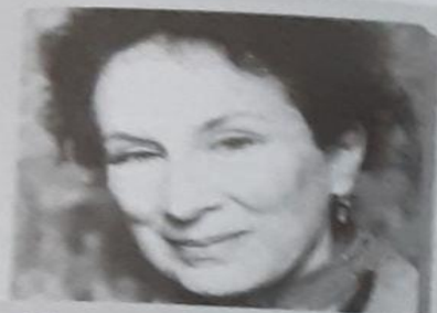
Margaret Atwood • 1939–

1 Complete the questions with the Present Perfect or the Past Simple.