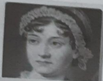
Jane Austen • 1775–1817