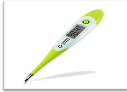
Fig(a): Show some of thermometers devices