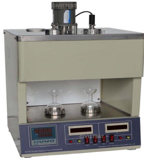
Figure1: Saybolt Viscometer test