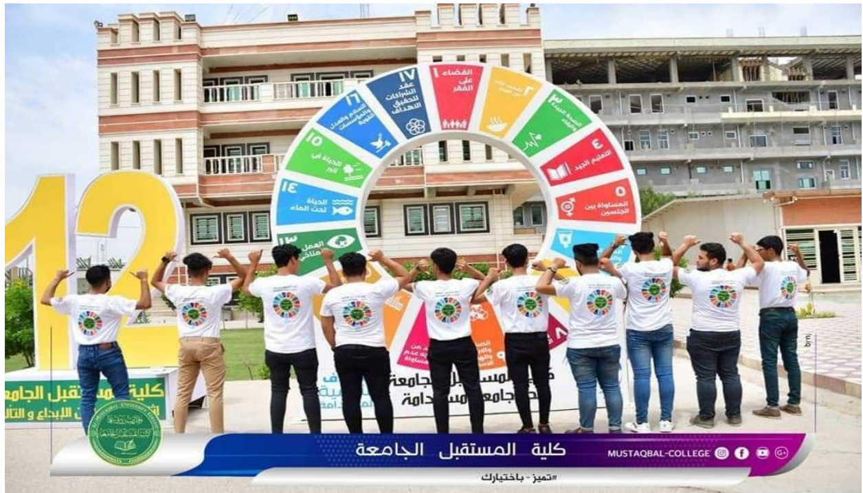
كلية المستقبل الجامعة MUSTAQBAL-COLLEGE تميز - باختيارك